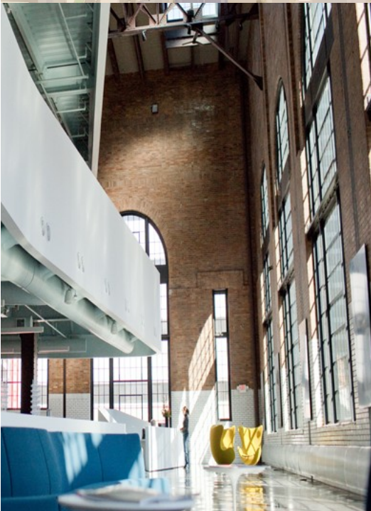
Top to bottom: Deloitte building, HOK in Metropolitan Square, Cannon Design building